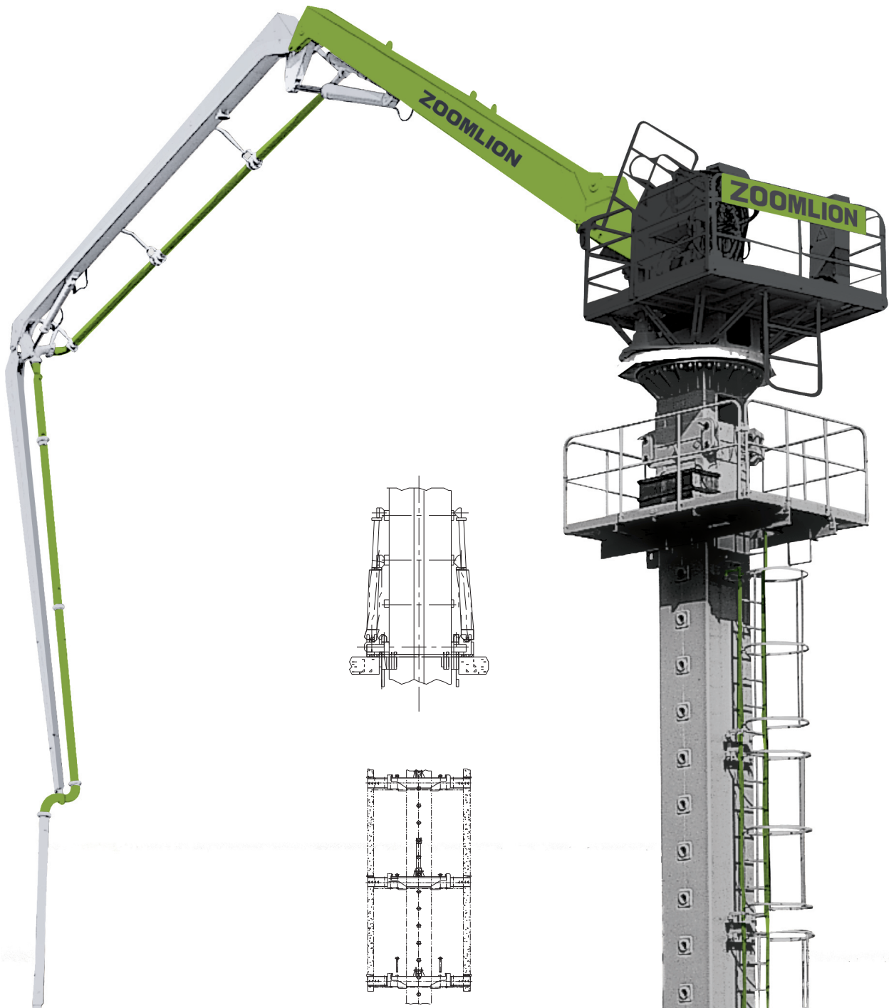
Automatic Climbing System(Choose one)